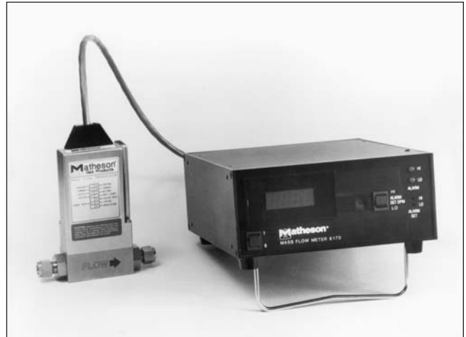
8170 Mass Flowmeter System

Matheson offers many innovative mass flow configurations. The Model 8280 Series Dynamic Gas Blending Systems , used in conjunction with additional mass flowmeters or mass flow controllers, are used to prepare accurate mixtures of different gases. Matheson's Cal-MAT™ 4000 and 4040 Series provide gas blending or dilution capabilities, and are controlled via communication with an end-user's PC system.