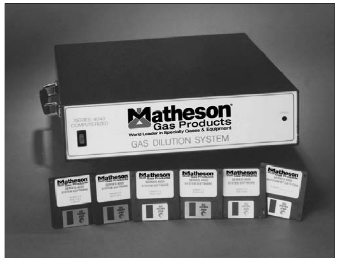
Cal-MAT™ 4040 Series Gas Dilution System