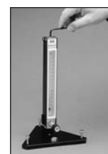
5. Tighten end seals