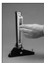
2. Remove Tube-Cube®