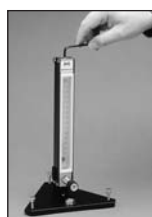
1. Loosen end seal