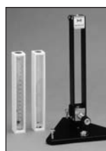
3. Select replacement Tube-Cube®