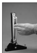
4. Reposition Tube-Cube®